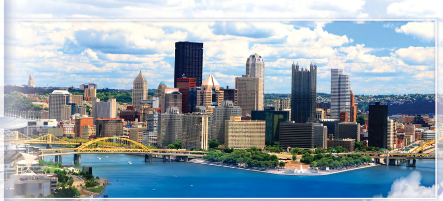
THE ONLY AUTHENTIC AMERICAN MBA IN BRAZIL

JOSEPH M. KATZ GRADUATE SCHOOL OF BUSINESS