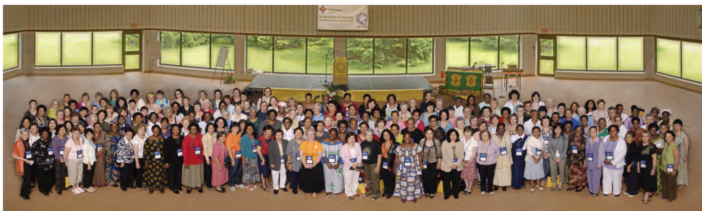
Participants at the 2007 WDP International Meeting, Toronto, Canada

with 125 women from 42 countries, and thanks to the thorough preparation by the Provisional Executive Committee elected then, the women gathered around the big table could begin their work with the decision to form an International Committee for World Day of Prayer. “The motion was unanimously accepted by a standing vote, after which the group sang the Doxology as an expression of gratitude for a dream realized.”