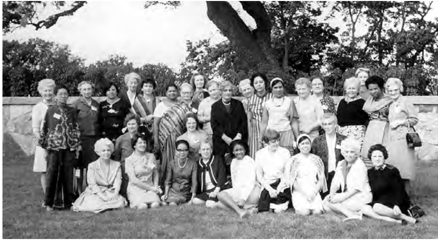
Founding meeting of the International Committee WDP, Vallingby, Sweden 1968

Women around the world celebrate this year the 50th anniversary of the World Day of Prayer International Committee that was founded in 1968. This anniversary is an opportunity to remember how it all began and how we got to where we are now. It is a chance to consider how the past is linked to the present and to understand how something that exists now took its shape then.