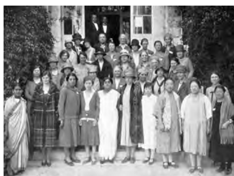
Women advisors to WDP among the participants at the World Missionary Conference in Jerusalem 1928

Changing the date of WDP from the first Friday in Lent to the first Friday in March had been recommended by the Anderson Consultation. One consideration was that the date for the first Friday of Lent could be as early as February 9 and that women living on the Northern hemisphere were quite often prevented by ice and snow to attend the services. The main reason however was the differ-