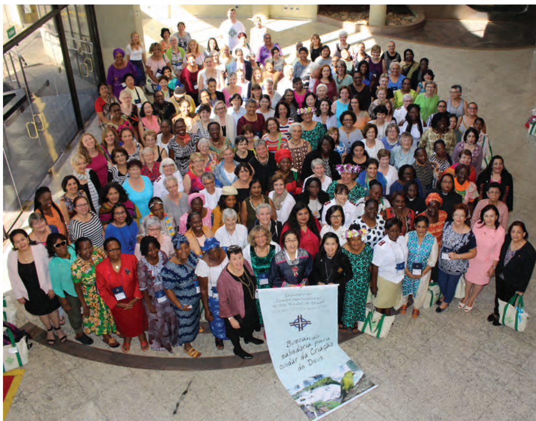
WDPIC 2017 International Meeting

SAVE THE DATE! RAISE FUNDS BY TELLING A WDP STORY!