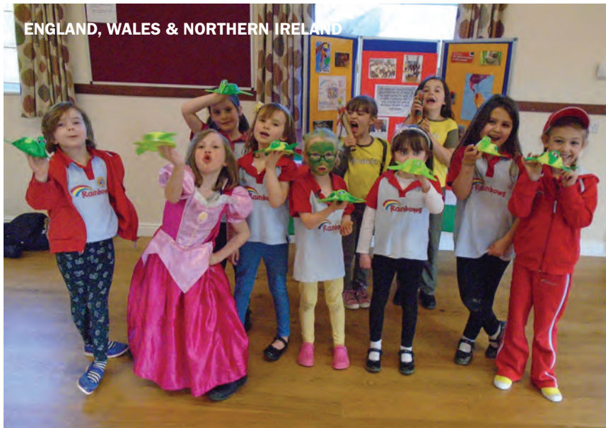
ENGLAND, WALES & NORTHERN IRELAND