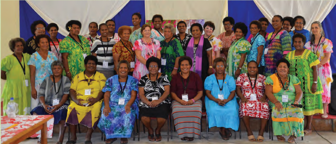
Vanuatu Preparatory Workshop