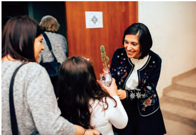
Pine shoots distributed to participants by WDP Lebanon

Raising awareness is one of the strongest contributions of World Day of Prayer to the women-led ecumenical movement. The sisters from Suriname established the connection between faith and life by demonstrating how