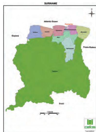
World Day of Prayer Writing Committee, Suriname